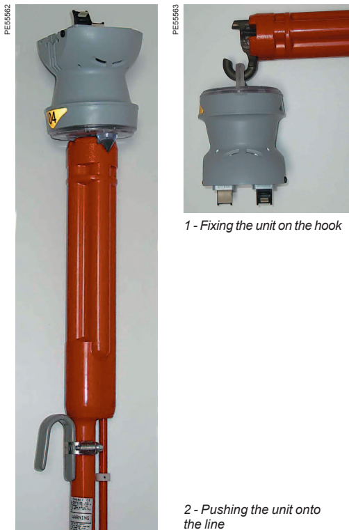
1 - Fixing the unit on the hook