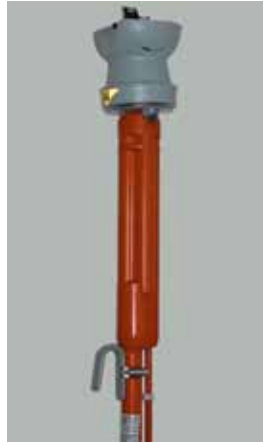
2 – Pushing the unit onto the line