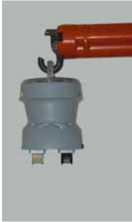
1 – Fixing the unit on the hook